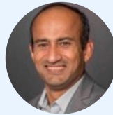
Pradeep Vaswani Global Head of Data and AI Programs AWS

Do you have fluid access to data honed for a specific business context or problem to leverage Generative AI? Can you relate to the struggles that come with a digital transformation journey? Understanding “what great looks like,” or data privacy, security, compliance, or creating a data-driven culture just to name a few. Do your business and IT teams struggle to align on a data strategy?